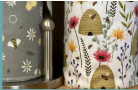
Reusable paper towels

...Or make your own reusables and don't forget to use cloth shopping bags