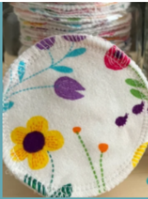
Reusable cotton rounds