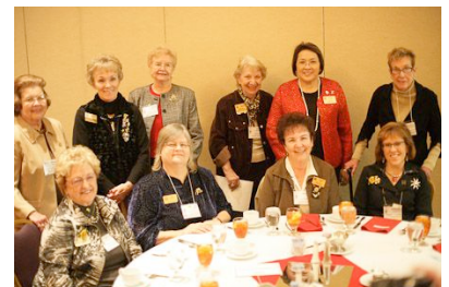
Past District 12 Governors, Current Governor and International Rep. from the Philippines.