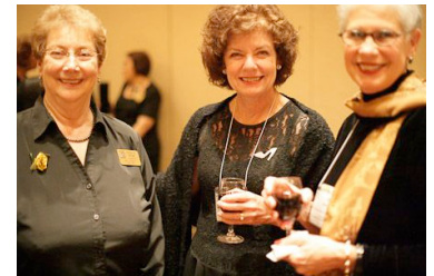
Formal gatherings included 97 Zonta members plus guests.