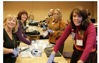
Zontians assembled 945 birthing kits that will be sent to Haiti, India and African nations.