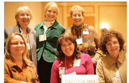
Pikes Peak Area Club Attendees