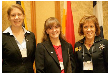
PhD candidates and winners of Amelia Earhart scholarships with District 12 Governor