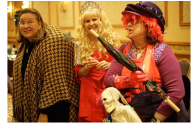
Halloween Party animals