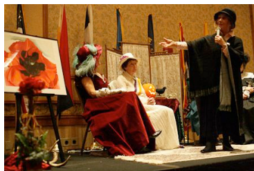
Legendary Women performances